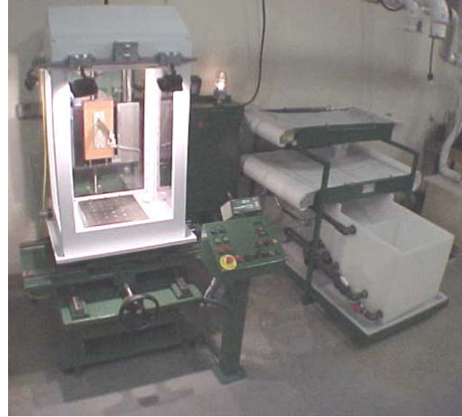
3-Axis, Batch Mode ECM Positioning System for the FARADAYIC® Process

A 3-axis ECM positioning system was designed and built to accommodate batch mode part processing. This machine enables a contract services capability for its FARADAYIC® Edge and Surface Finishing technology area, which is critical for processing evaluation parts for potential clients, as well as for pursuing services revenue from batch mode part processing. The cross-sectioned surface profile before and after ECM surface finishing for Ti-6Al-4V specimens indicate that the FARADAYIC® Process improves the surface quality (such as reduction in surface roughness). The processing time for a successful removal can be very short, and often utilizes a water based electrolyte containing sodium nitrate (NaNO 3 ) and sodium chloride (NaCl), the latter being essentially table salt.